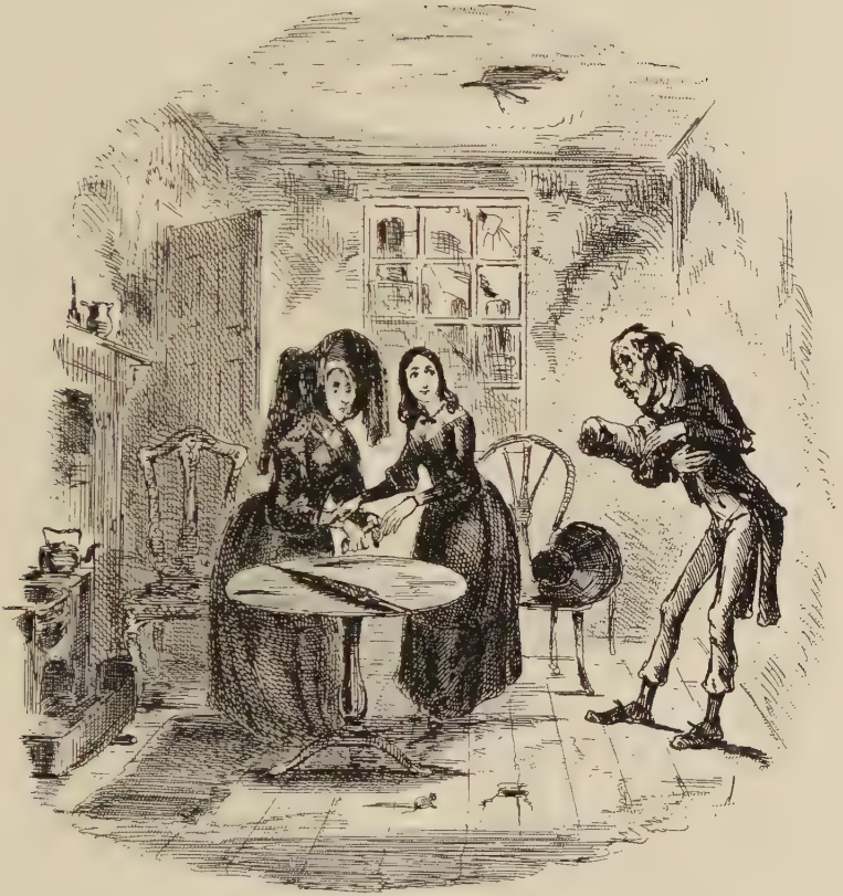
NEWMAN NOGGS LEAVES THE LADIES IN THE EMPTY HOUSE.